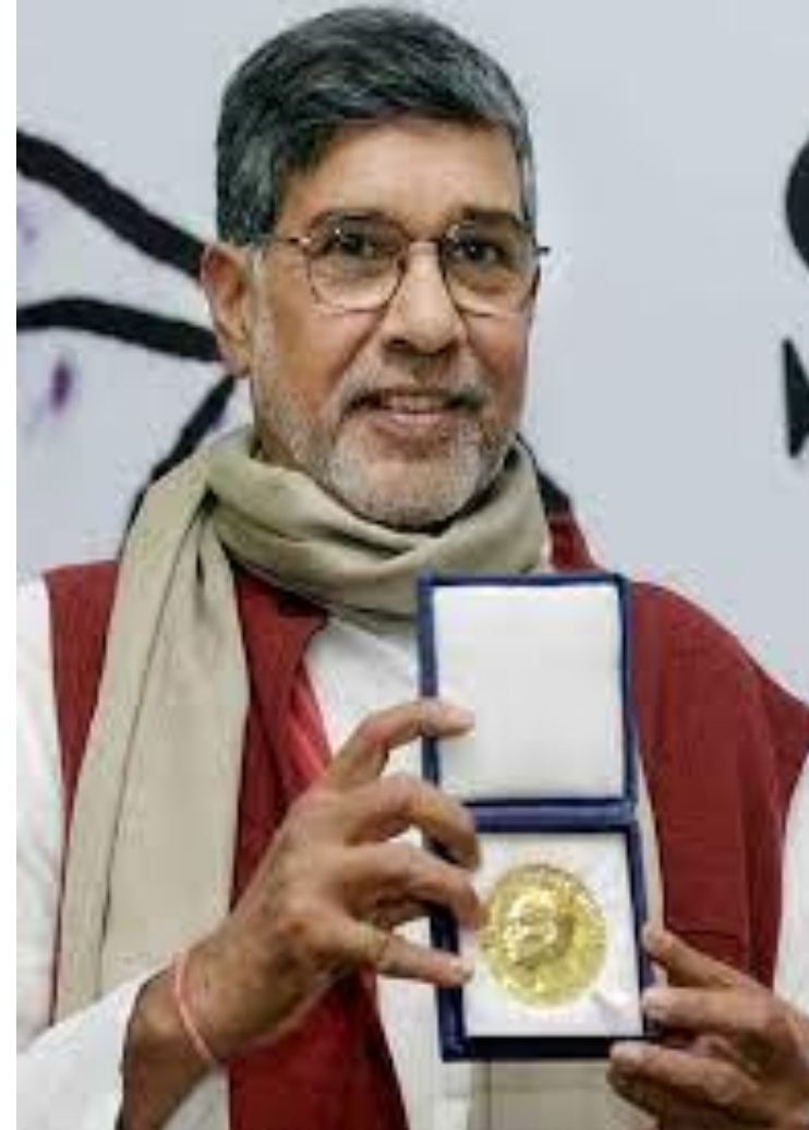
Nobel Peace Laureate Kailash Satyarthi